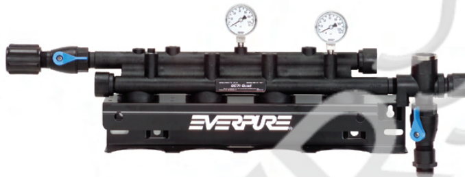
QC7I Quad Parallel Head: EV9336-11

Engineered for durability, strength and longevity. Will not corrode